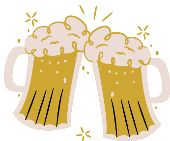
PFNC PLAYER AUCTION - 2024